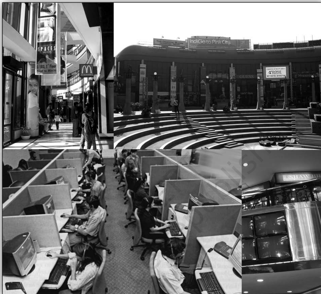
Technological development in different areas

economy does badly (as happened after the 9/11 attacks on the World Trade Centre in New York), leading to loss of business and jobs here. The software services industries and business process outsourcing ( BPO ) industries (such as call centres) are some of the major avenues through which India is getting connected to the global economy. Companies based in India provide low-cost services and labour to customers located in the developed countries of the West. We can say that there is now a global market for Indian software labour and other services.