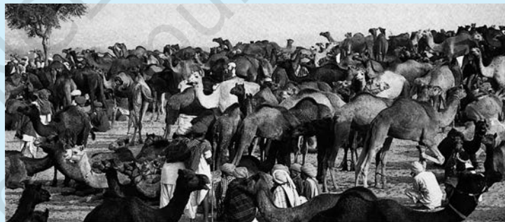
Cattle market in Pushkar fair