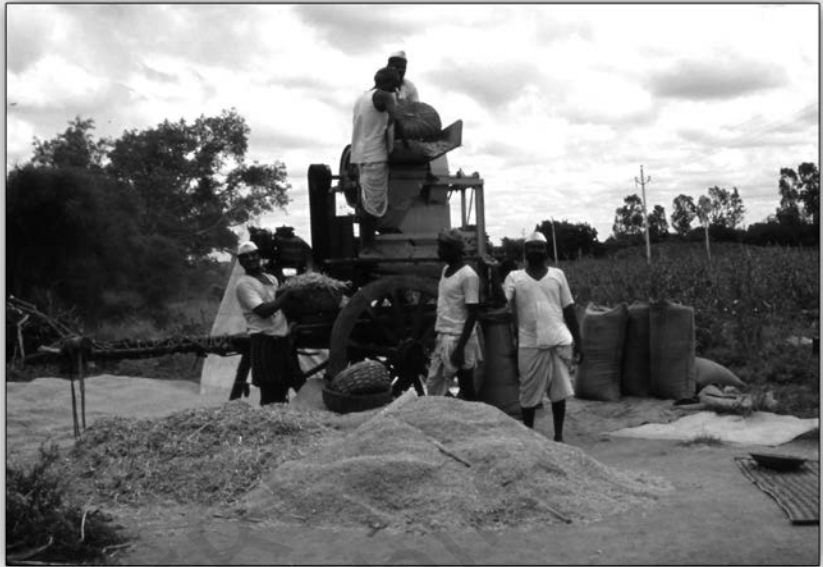
Agricultural work in a village

To understand the operation of markets in India, both in earlier periods and at present, we can examine how specific arenas of business are controlled by particular communities. One of the reasons for this caste-based specialisation is that trade and commerce often operate through caste and kinship networks, as we have seen in the case of the Nakarattars. Because businessmen are more likely to trust others of their own community or kin group, they tend to do business within such networks rather than with others outside – and this tends to create a caste monopoly within certain areas of business.